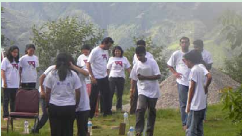
Participants engaged in a group activity