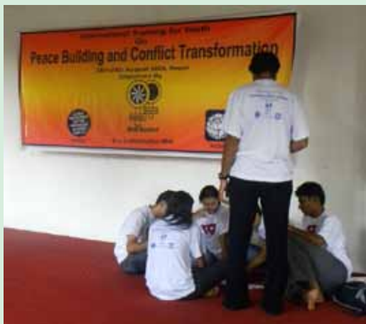
Being mentored by the trainer

An immediate impact on the youth was seen when within a week after the training, the whole group got connected to an email loop. Events pertaining to peace and conflict, and community activities are now being regularly shared and invitations are being sent out for participation. Some participants have shared in a community radio interview the positive impact of the training programme on their daily lives.