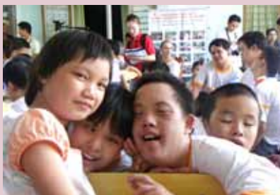
Third generation of Agent Orange Victims

With this in mind GPPAC recently organized a training workshop for its media outreach people, the Media Focal Points (MFPs). Nilakshi Gunatillake, GPPAC –