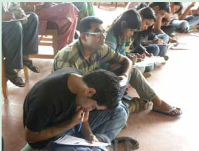
Participants engrossed in re-thinking peace